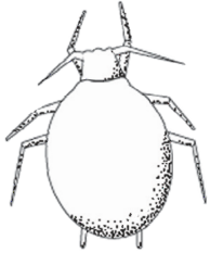
Mummy (Parasite) Tan, bloated body