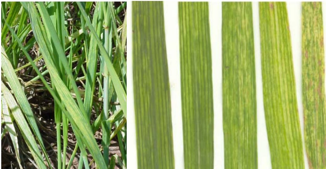
Figure 1. Symptoms of wheat streak mosaic virus on wheat plants in the field

Current situation: Strong symptoms of Wheat streak mosaic virus (WSMV) (see Figure 1) are being observed in multiple wheat fields across the panhandle and western Oklahoma. To date (April 19), we have received wheat that has tested positive for the presence of WSMV from southwestern OK (around Altus), northern Oklahoma (around Dacoma), and the panhandle. The last time I saw significant levels of WSMV in Oklahoma was during the spring of 2002 when WSMV was observed across western OK from the southern to the northern border. In Oklahoma, WSMV occurs only in the western part of the state, which I believe is related to the mite vector being limited to this part of the state due to climatic conditions.