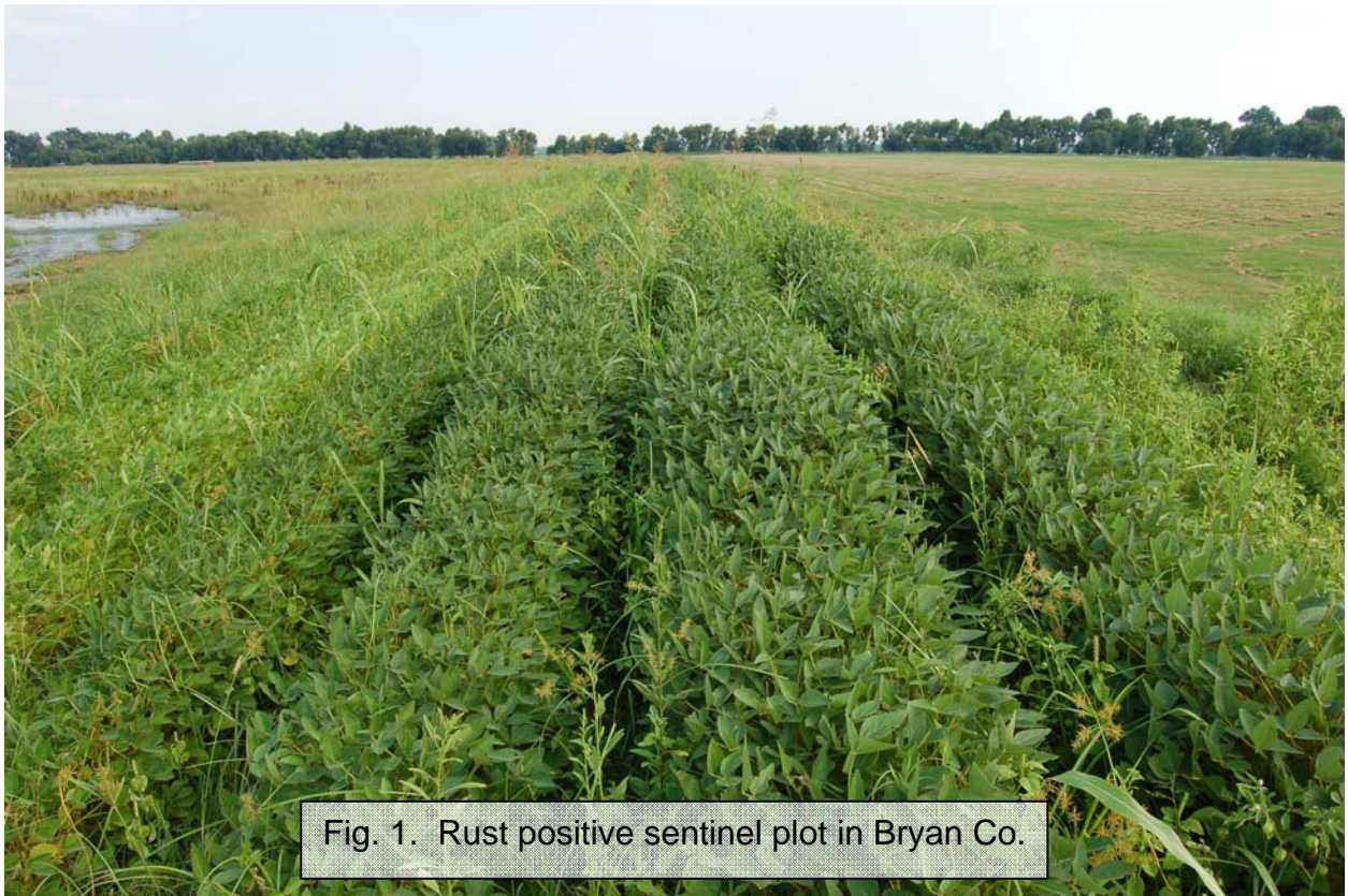
Fig. 1. Rust positive sentinel plot in Bryan Co.