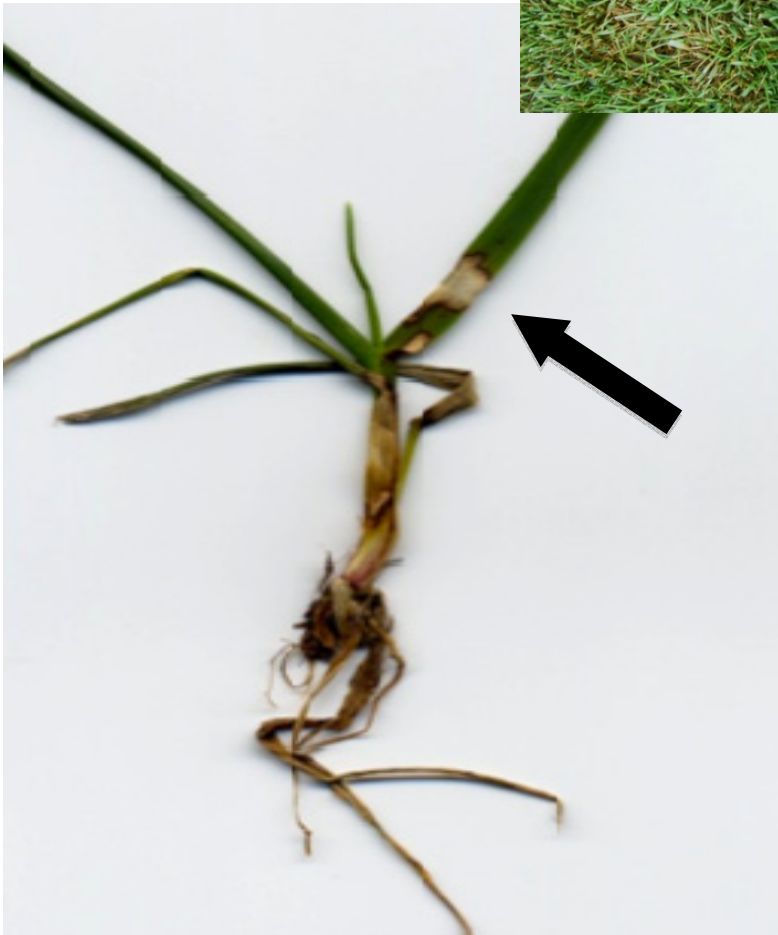
Fig 3. Leaf symptom of brown patch on a tall fescue plant. Note the beige leaf lesion with the dark brown irregular border (see arrow).