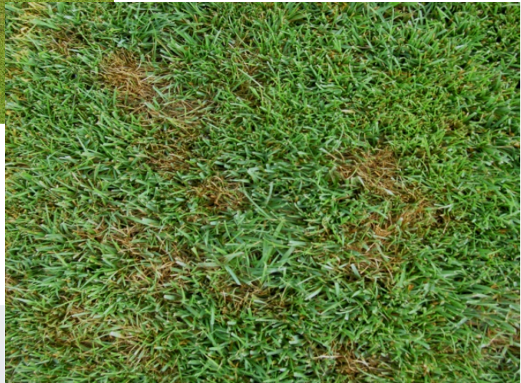
Fig 2. Symptoms of brown patch on tall fescue.