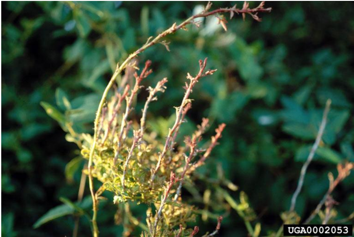
Fig 2. Witches' broom caused by rose rosette disease. (Photo Credit: James Amrine, West Virginia University, www.bugwood.org ).