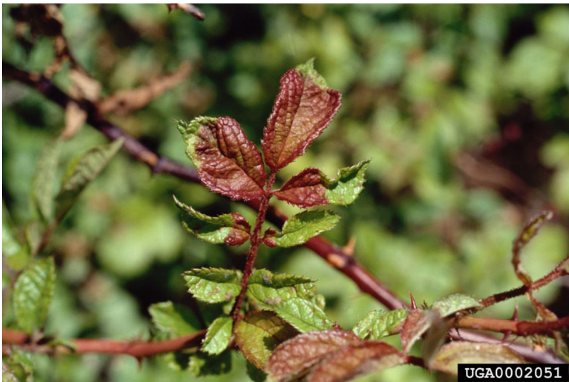
Fig 1. Bright red leaf pigmentation caused by rose rosette disease.

Rose rosette was first described as a disease of rose in the 1940s. Rose rosette is widespread in wild rose stands east of the Rocky Mountains. Symptoms include leaflet distortion, bright red leaf pigmentation (Fig. 1), witches'-broom (Fig. 2), and canes that grow slow and are excessively thorny (Fig. 3).