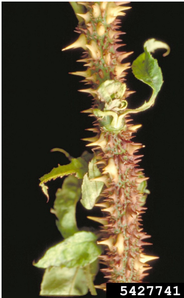
Fig 3. Excessive thorniness of rose canes is a symptom of rose rosette disease.