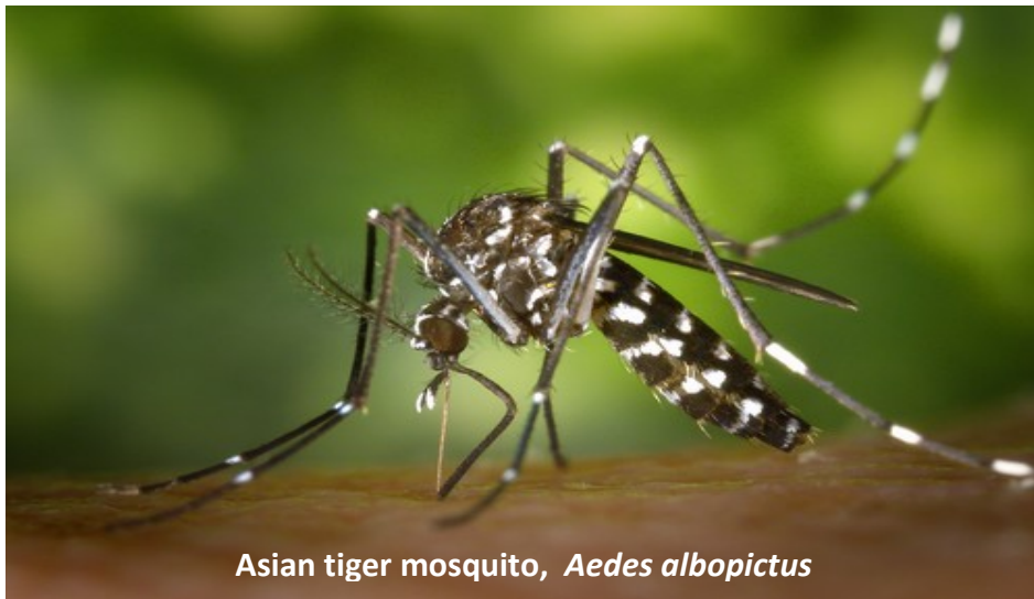
Asian tiger mosquito, Aedes albopictus

This species is difficult to control in the larval stage because it occurs in many small containers that hold water. The usual mosquito adult sprays do not work well because these sprays must be applied around sunset or later when the thermal currents are not rising and when most mosquitoes are active. Since the Asian tiger mosquito is most active in mid-to-late afternoon, the usual mosquito adult spray programs are not applied when the mosquito is active and the spray droplets do not contact the adults.