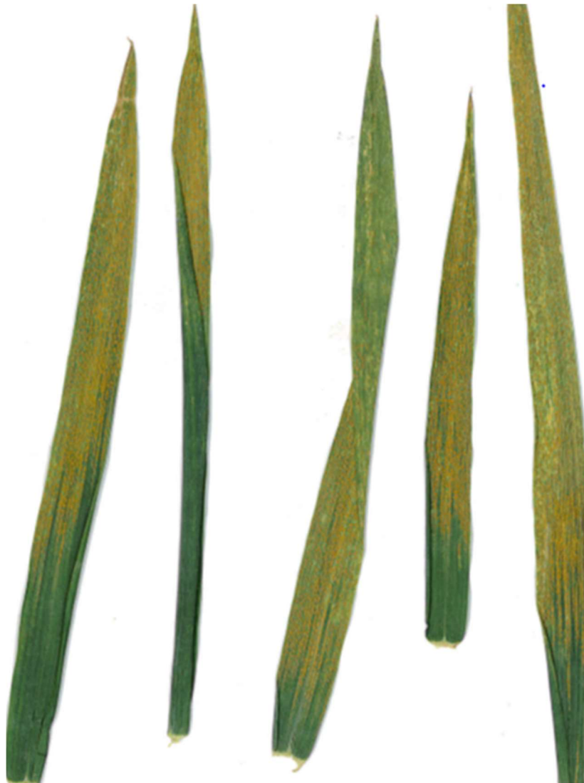
Stripe rust sporulating on wheat in central OK.

Cool temperature and rain also will facilitate foliar disease development. Especially over the last several days, there has been extended periods of dew on wheat, which provides an optimum environment for increasing foliar diseases. As temperature now rises, leaf rust should become more common. In fact, reports from Texas (see below – “Reports from Other States”) indicate increasing leaf rust in Texas. Brian Olson (Senior Agriculturalist OSU) spent yesterday rating breeder lines here at Stillwater. He reported seeing some active stripe rust, but increasingly more powdery mildew, leaf rust, and barley yellow dwarf. Dr. Brett Carver (OSU Wheat Breeder) reported much the same at the Pasture Research Center near Marshall, OK (about 30 miles west of Stillwater). However, stripe rust is still active as indicated by the photo below from J. Wes Lee (Extension Educator; McClain Co. in central OK).